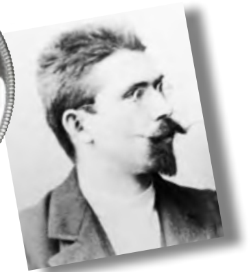
3 Steel Ø 39 mm 517.10 LR L01 € 2.360 Platinum Ø 39 mm 517.70 LR L01 € 12.550

Louis Reguin Edition This exclusive edition bares an historical motive on its traditionally made enamel dial, created by the famous Swiss miniaturist painter Louis Reguin (1872-1948). A mechanical pieces of art, being esteemed and searched for by lovers and collectors.