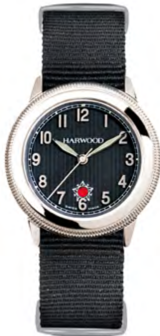
5 Steel Ø 35 mm 500.10.11 N01 € 1.900