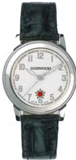
6 Sterling Silver Ø 35 mm 501.41.12 LC01 € 2.255 croco strap