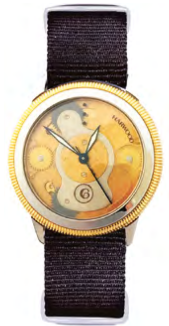
7 Steel / 10 MC Ø 35 mm fluted bezel rim gold plated 502.60.5 N01 € 2.100

All prices are recommended retail selling prices including 19 % VAT.