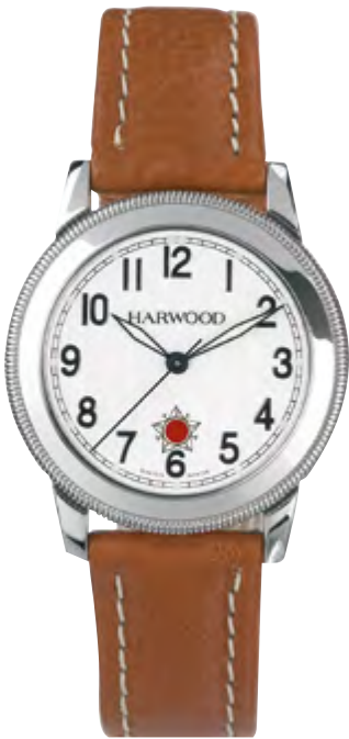
4 Steel Ø 35 mm 500.10.15 L08 € 1.950