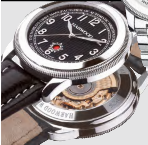
1 Steel Ø 39 mm 516.10.11 L01 € 1.950 Platinum Ø 39 mm 516.70.11 L01 € 12.150